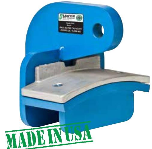
Pipe Hook (231C) High Capacity Sizes 44"—72"