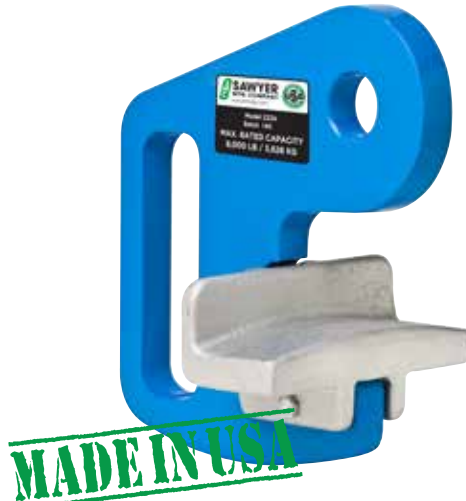
Pipe Hook (233) Wide Mouth Sizes 3"—42"