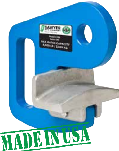
Pipe Hook (232) Sizes 3"—42"

Extra thick steel for longevity and greater safety